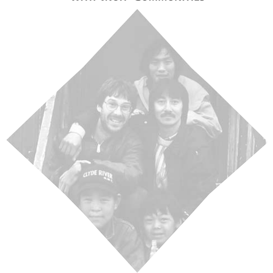
A Guide for Researchers