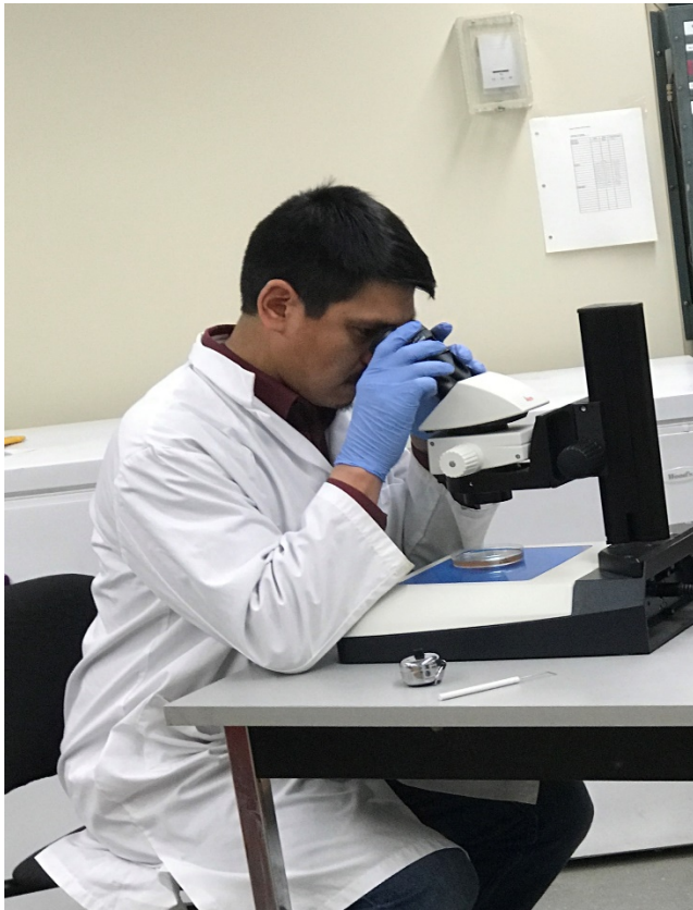
Trichinella Analyst Examining a Sample

a 24-hour period. Test results will be reported by the Department of Health. Please ensure your phone number is included in the Sample Information Sheet.