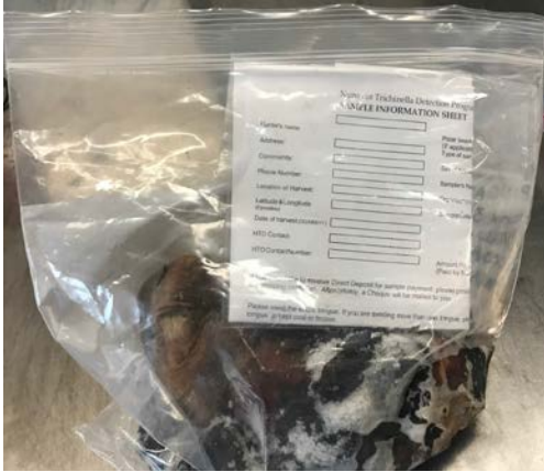
Figure Two: Walrus Tongue Sample with Information Sheet